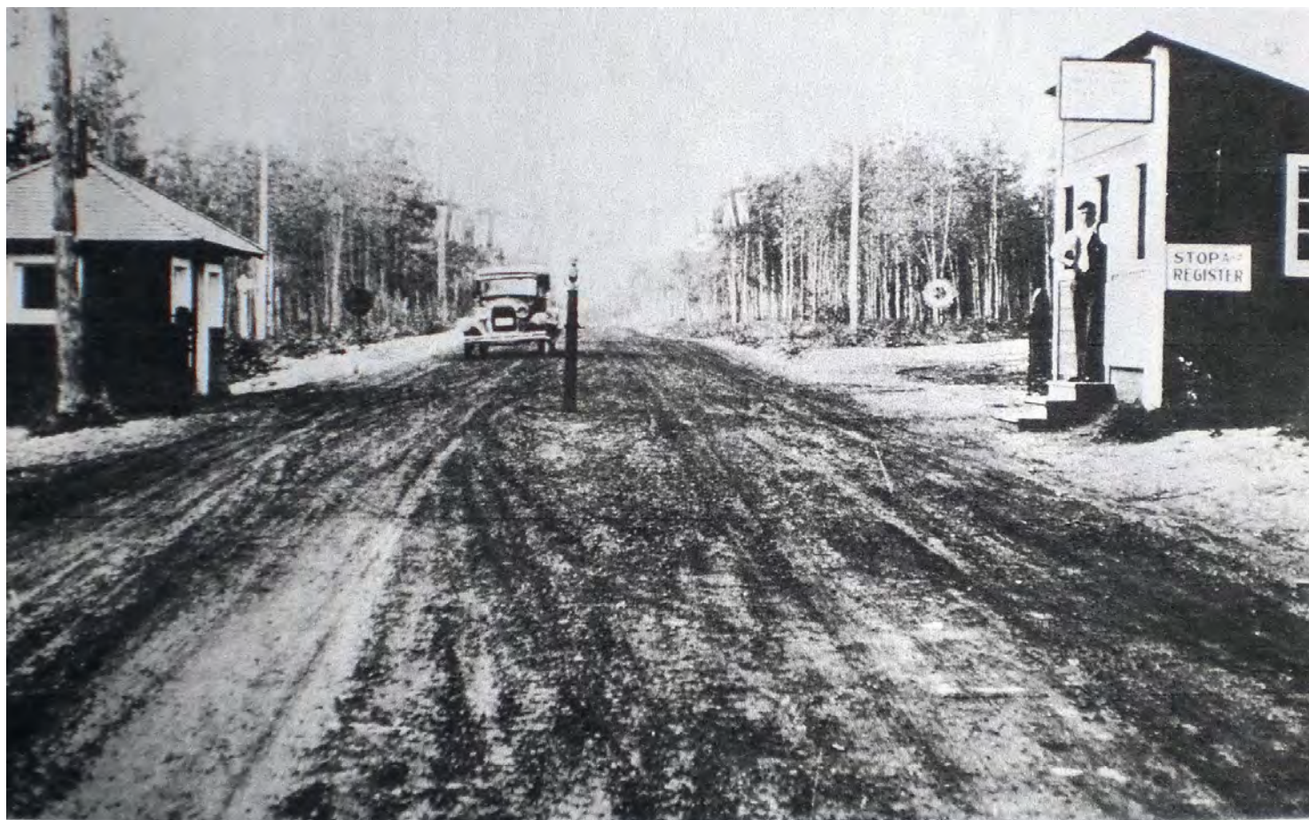
PARK GATES, 1920's