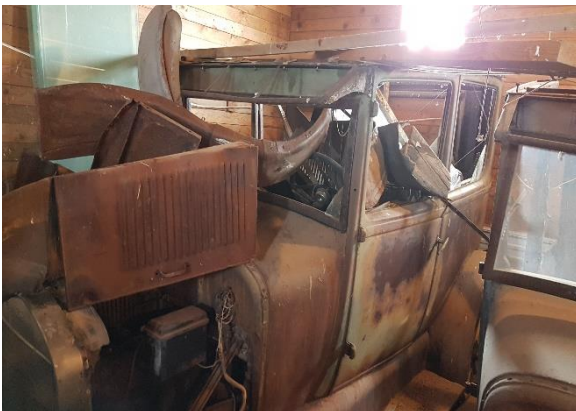
Some of the extra parts needed to complete it.

For Sale: Canadian Built 1926-27 Tudor. Car was converted to a Delivery Sedan. Many added parts and, an 'A' converted Crankshaft. $4500 US / $6000 Cnd. OBO. Call Bob Hauswirth Phone: 403-288-9284 Carlorna@Telusplanet.net (1)