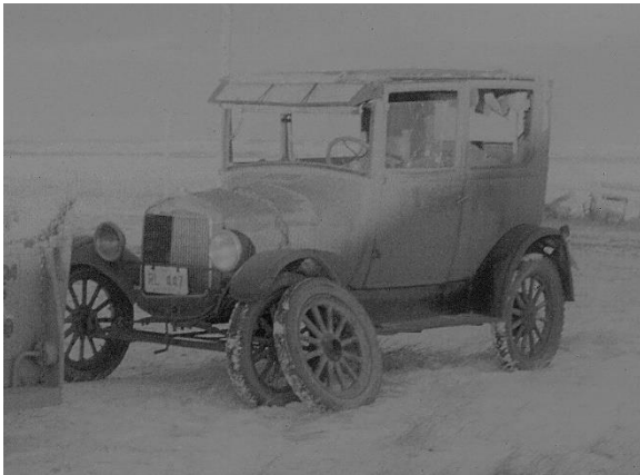
As found 20 years ago, barn stored since.

For Sale: Model T Parts 5-26/27 headlight buckets, bar mount, 3-Headlights 1926, fender mount, 26 fender mount sealed beam, various reflectors and some lenses. Model T coil box wood T-5000-w, 1915-25, New 26/27 Model T Headlight, includes 2 chrome rims, 2 lenses, 2 reflectors. Wheels, various wood felloe wheels / metal, non-demountable, or demountable and different types of lugs. 26 -27 T Roadster body, no turtle deck or box, front fenders, running boards, splash aprons, hood, windshield frame, on rolling chassis wood spoke wheels, motor stuck, $ OBO. 1916 T engine block only, Cast USA. Model A front axle and spindles. Al Riise 403-274-4474. Calgary