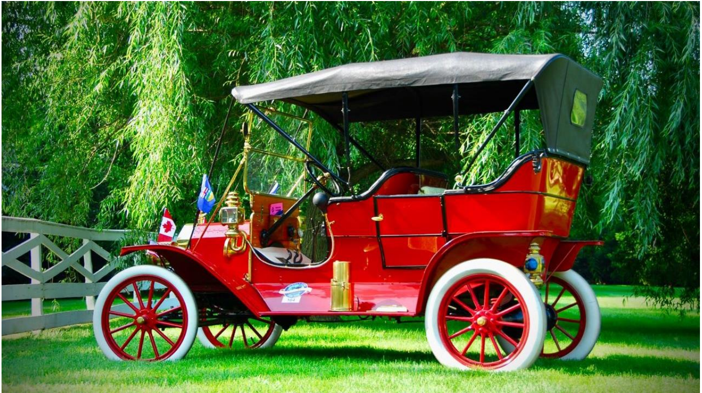
Picture taken at the Centennial T Party at Richmond Indiana