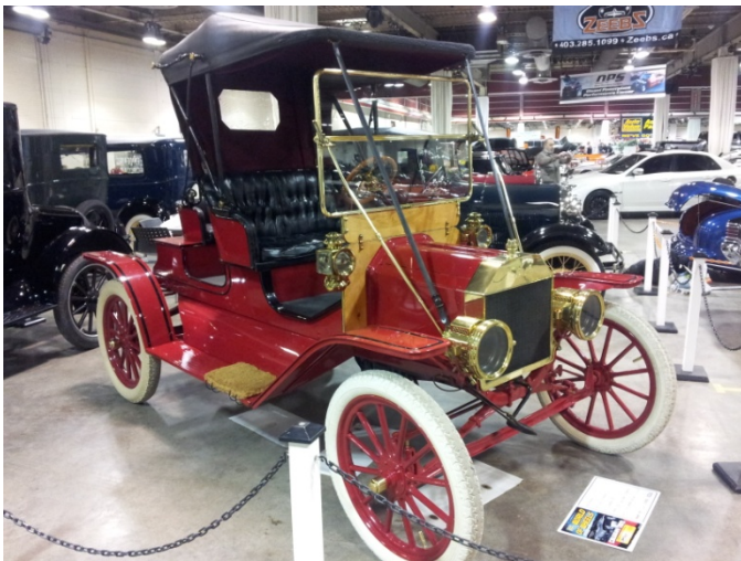
Our 1909 won first in class