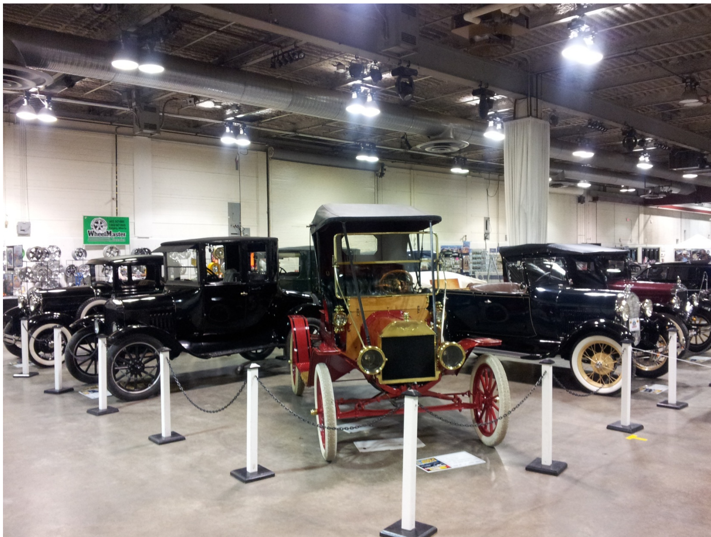
Our joint display at the World of Wheels 2013

T Footnotes is published 9 times a year by the Foothills Model T Ford Club, Calgary Alberta - Chapter of the Model T Ford Club of America. This newsletter is dedicated to the preservation, restoration, and enjoyment of Model T Fords by all Flivver enthusiasts. Opinions expressed in "T Footnotes" are those of the authors and are not necessarily those of the Foothills Model T Ford Club. Articles may be reprinted provided credit is given. All information is provided for your enjoyment and education only. No one associated with the T Footnotes can be held responsible for errors, omissions, or misinterpreted information even though all efforts will be made to ensure correctness of the articles.