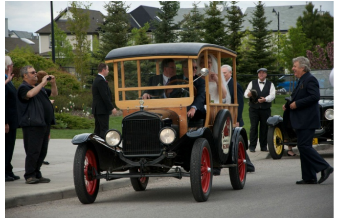
A few club members for the send off