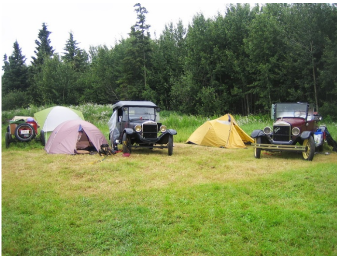
Notice Max between T & tent

Max (Tom's dog) bolted out of the tent at 3 AM to meet an amorous coyote parading near the lake shore. Fortunately he was tied up to the Model-T front wheel and not to my tent pole as suggested by some mischievous T campers.