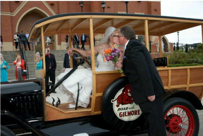
A little nooky before leaving