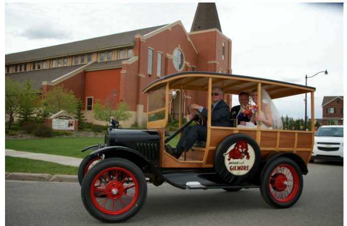
Leaving the church