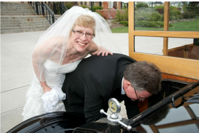
Turning on the gas