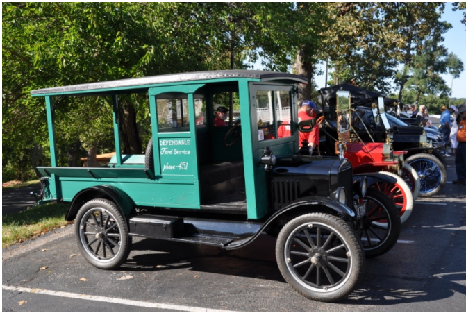
In the hotel parking lot

This was designated the National Tour this year held in the NW part of Arkansas, a very hilly area! The roads for the most part were very nice two lane roads with the biggest problem being you did not know whether it was uphill or downhill around the next bend. The drives were short compared to most tours, the longest day being around 100 miles round trip, which made it much more relaxing.