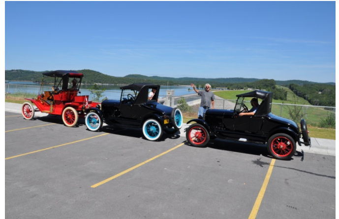
Lined up overlooking Beaver dam