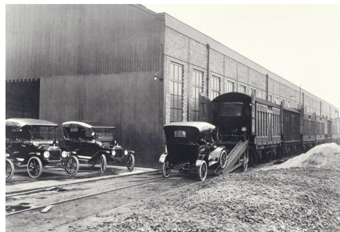
Trafford UK train loading