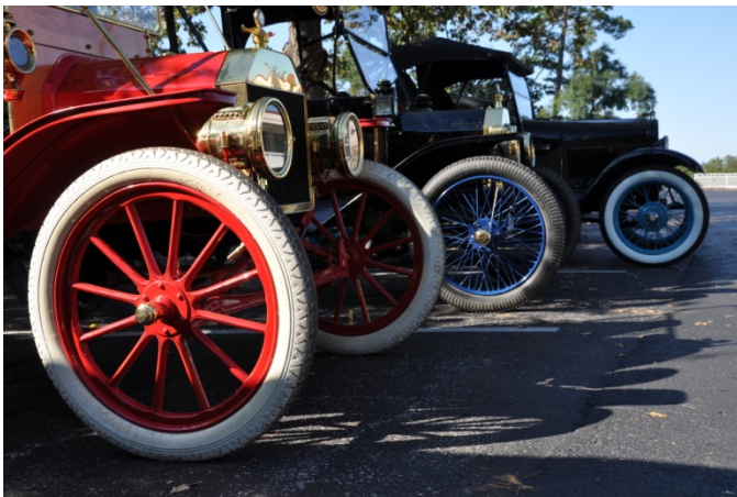
You should know who the last set of wheels belongs to!