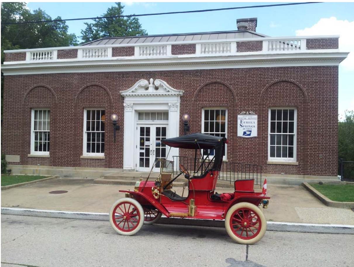
At the Eureka Springs AK post office on the Hillbilly Tour

T Footnotes is published 9 times a year by the Foothills Model T Ford Club, Calgary Alberta - Chapter of the Model T Ford Club of America. This newsletter is dedicated to the preservation, restoration, and enjoyment of Model T Fords by all Flivver enthusiasts. Opinions expressed in "T Footnotes" are those of the authors and are not necessarily those of the Foothills Model T Ford Club. Articles may be reprinted provided credit is given. All information is provided for your enjoyment and education only. No one associated with the T Footnotes can be held responsible for errors, omissions, or misinterpreted information even though all efforts will be made to ensure correctness of the articles.