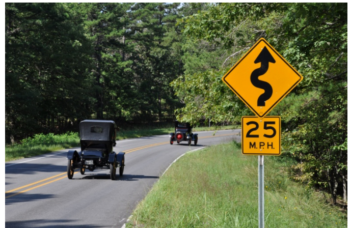
This is what most of the roads looked like