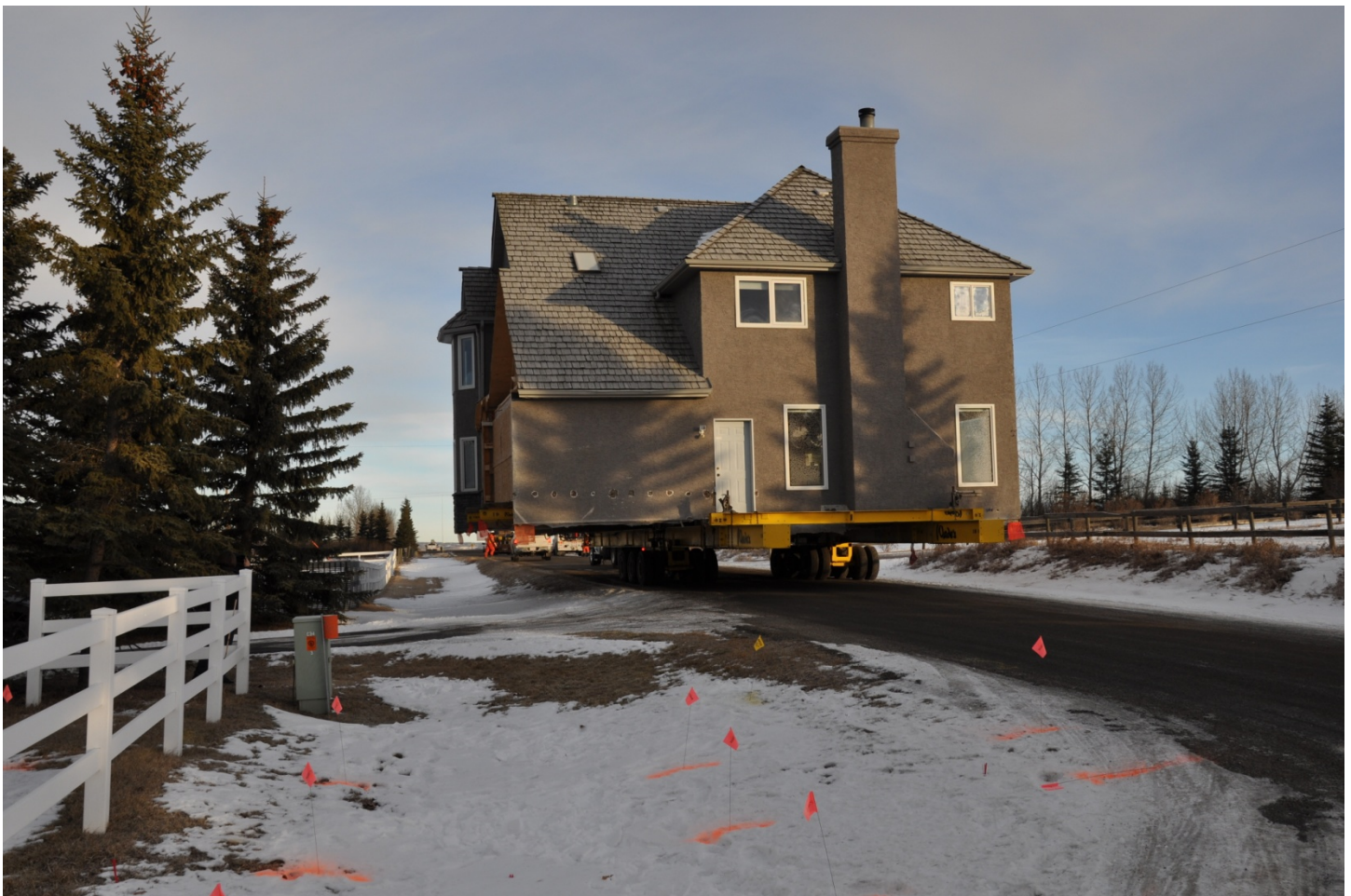
Our old house on the way to its new home west of Jumping Pound

T Footnotes is published 9 times a year by the Foothills Model T Ford Club, Calgary Alberta - Chapter of the Model T Ford Club of America. This newsletter is dedicated to the preservation, restoration, and enjoyment of Model T Fords by all Flivver enthusiasts. Opinions expressed in "T Footnotes" are those of the authors and are not necessarily those of the Foothills Model T Ford Club. Articles may be reprinted provided credit is given. All information is provided for your enjoyment and education only. No one associated with the T Footnotes can be held responsible for errors, omissions, or misinterpreted information even though all efforts will be made to ensure correctness of the articles.