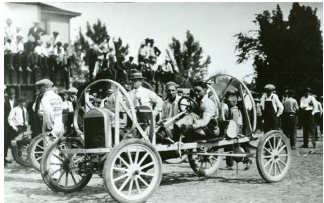
The S.M.C provided Polo Cars

After WW I the economy across the United States was in a sluggish mode. The rural areas were especially susceptible to the slow down. Being quite community minded, Roscoe sponsored a celebration for the people of