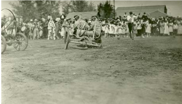
A broken wheel slows the action

perhaps hiding a gory death or severe injury. When the dust cleared, all participants were okay and still in the game. I know it's hard to believe, but in all the years my grandfather sponsored the Model T Polo games in Sunnyside, Washington, there were never any serious injuries. Broken wheels, burned up motors and blown out tires were mere incidents, considered as part of the game.