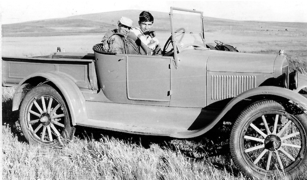
ERIC LUTHER ROBB - MODEL T