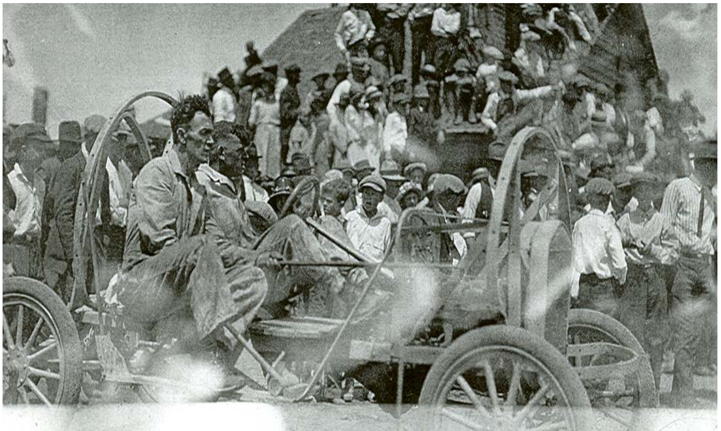
A close-up look at a polo car, notice the hoops front and back and the mallet

I am very proud of my Grandfather and the once very famous Sheller Motor Company. I've always felt that my love of Ford vehicles was, well ... in my blood!