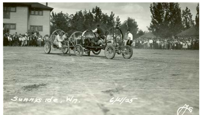
Who is after the ball?

The Model T Polo games were then moved to the outskirts of town where the huge plumbs of dust, generated by the racing Model T's, were no longer a problem.