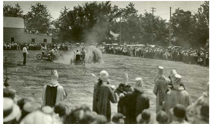
Yea, well ... eat my dust!

defying thrills of Model T Polo”. The games were originally held in a vacant lot in town. However, because of all the dust stirred up by two Model T's at full throttle heading for a basketball on the dry blow-sand dirt, loud complaints were registered by local housewives with concerns about their freshly laundered cloths being soiled while hung out to dry.