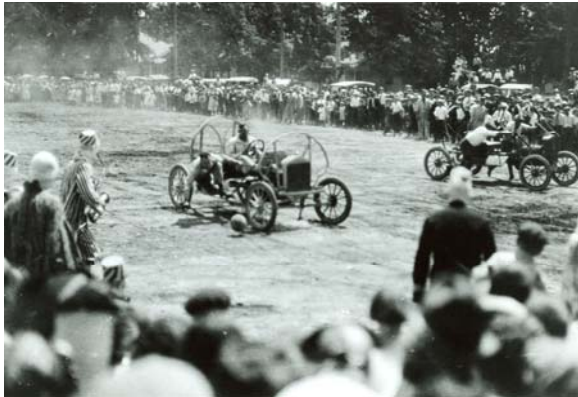
Polo Cars warming up for the game

The Model T Polo games were very well attended and much anticipated year after year. The gist of the game consisted of two Model T Fords stripped down to bare chassis with steel hoops front and rear as some sort of protection against a roll over, when rudely nudged by another Model T. Believe me “nudged” is a very gentle description of the action taking place on the field. One running board on the right side was left in place for the mallet man, who held on to a grab handle with one hand while clutching a leather mallet in the other.