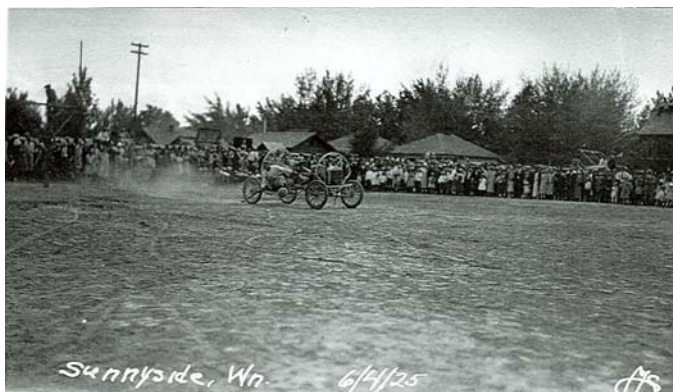
Ready to go, let's play some polo

The Model T Polo games were very well attended and much anticipated year after year. The gist of the game consisted of two Model T Fords stripped down to bare chassis with steel hoops front and rear as some sort of protection against a roll over, when rudely nudged by another Model T. Believe me “nudged” is a very gentle description of the action taking place on the field. One running board on the right side was left in place for the mallet man, who held on to a grab handle with one hand while clutching a leather mallet in the other.