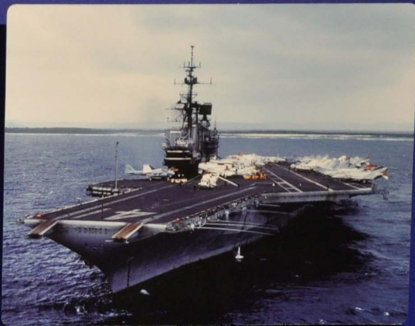
USS Midway (CV-41)