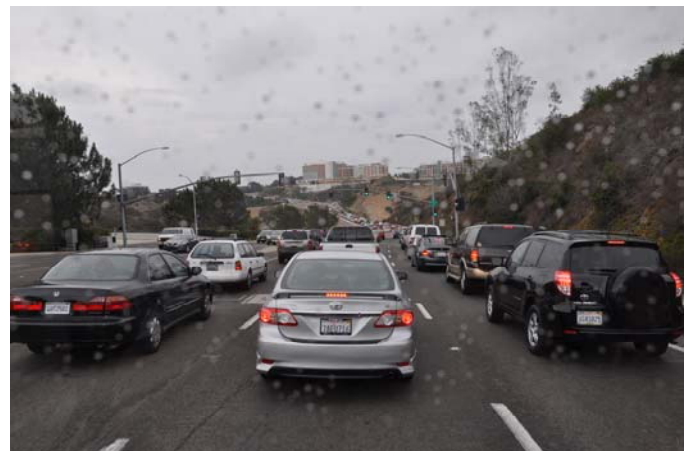
A little rain, a little traffic!