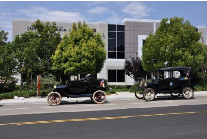
The Craftsmanship Museum