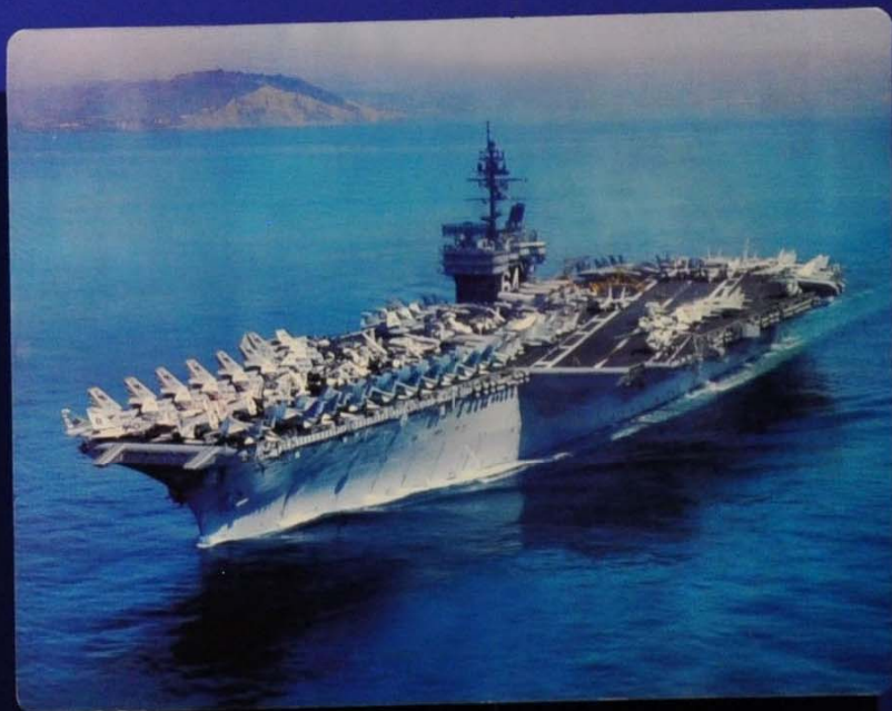
USS Constellation (CVA-64)