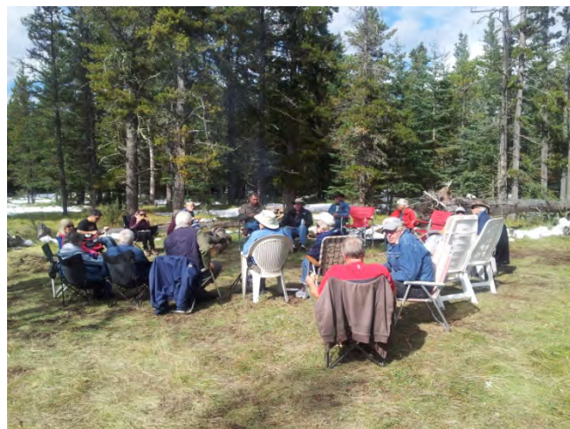
Around the campfire