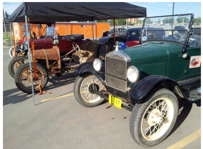
Les' roadster, Robb's speedster