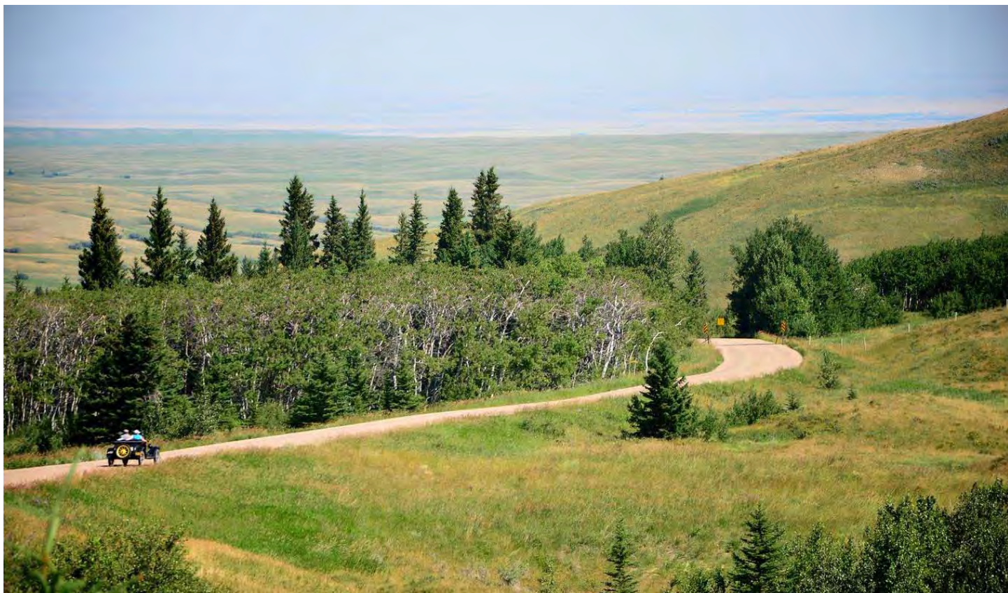
Prairie Vista, taken near Cypress Hills (I believe)

T Footnotes is published 9 times a year by the Foothills Model T Ford Club, Calgary Alberta - Chapter of the Model T Ford Club of America. This newsletter is dedicated to the preservation, restoration, and enjoyment of Model T Fords by all Flivver enthusiasts. Opinions expressed in "T Footnotes" are those of the authors and are not necessarily those of the Foothills Model T Ford Club. Articles may be reprinted provided credit is given. All information is provided for your enjoyment and education only. No one associated with the Foothills Model T Ford Club can be held responsible for errors, omissions, or misinterpreted information even though all efforts will be made to ensure correctness of the articles.