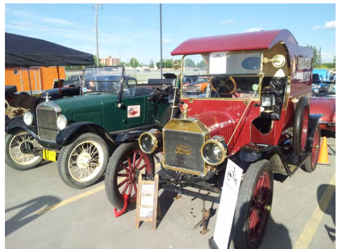
Ross' pie wagon