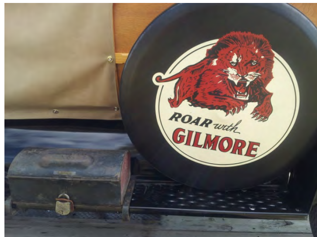
No more roar, from Gil more !!