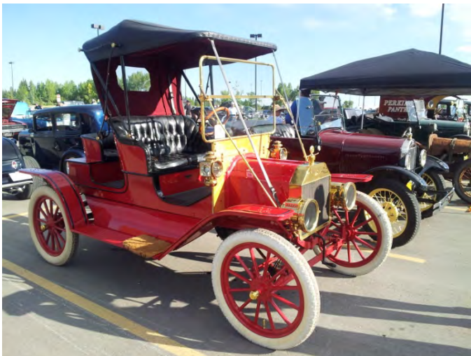
Chris B 1909 Roadster