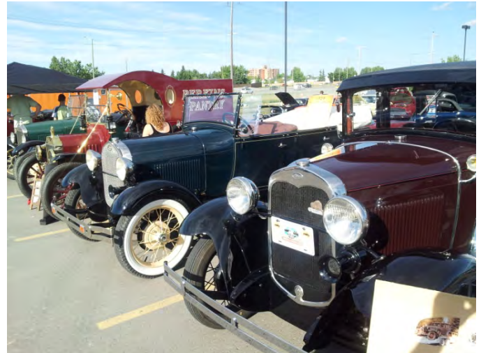
Keith's Model A phaeton