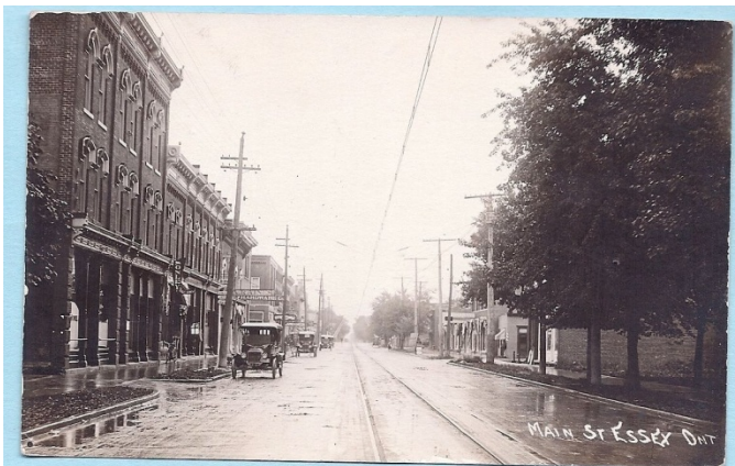
Main St, Essex Ontario