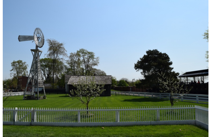
Back of Henry Ford birth home, train on the right

Henry started collecting very early, in the 20s & 30s and has accumulated many original items, no need to make recreations in many cases. There is so much to see they sell a 3-day pass.