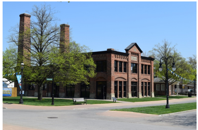
An Edison power plant