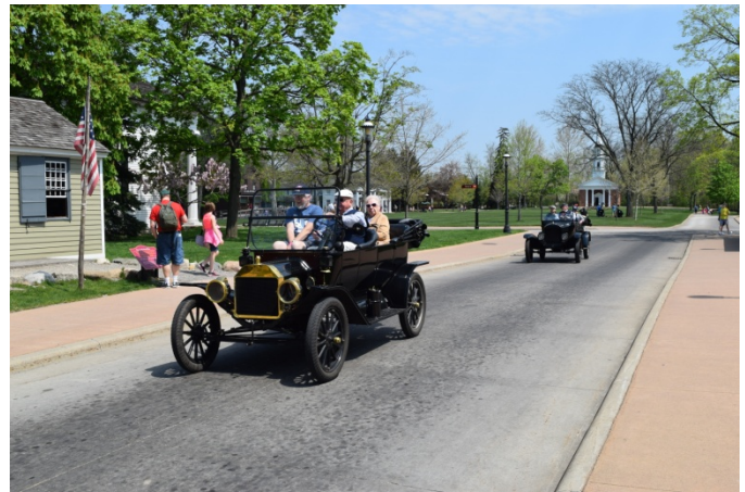
Model T rides are offered