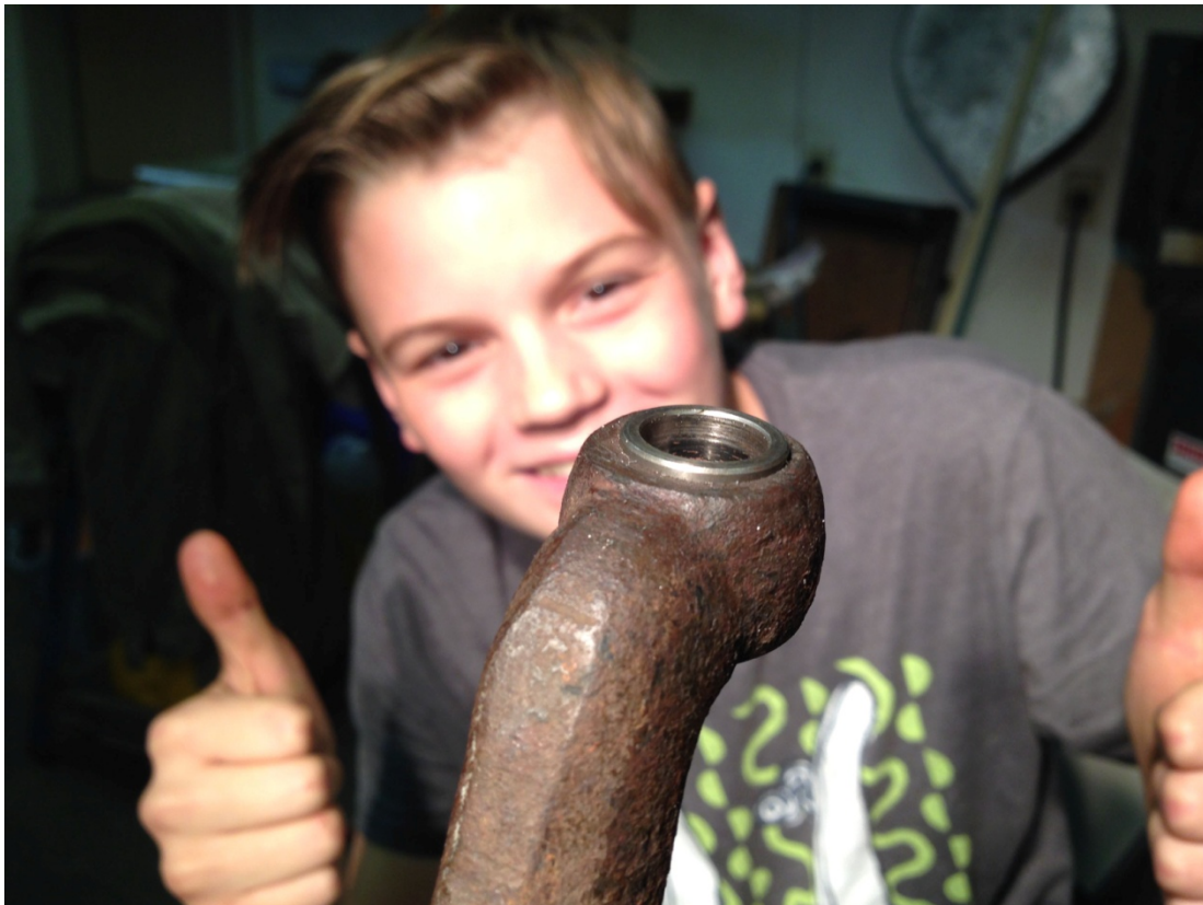
Top of axle showing insert installed