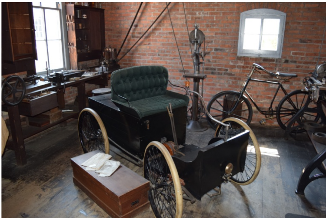
Recreation of Henry's Bagley Avenue shop