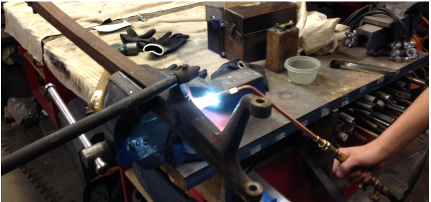
Applying the heat wrench to the perches, old-axle pry bar twisting