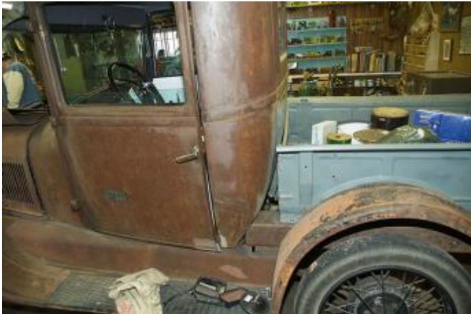
Emile Hermary's closed cab pickup

The former method of converting a Tudor to a pickup was to cut the body at the back edge of the rear window and eliminate everything from there to the door pillar. The raw edge of the rear section was then crimped around the door pillar. A small section of the lower quarter which had been cut out for the wheel well also needed to be patched.