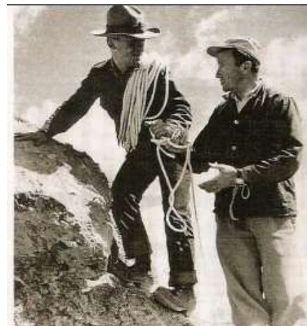
Ya Ha Tinda Ranch - 100 years' old