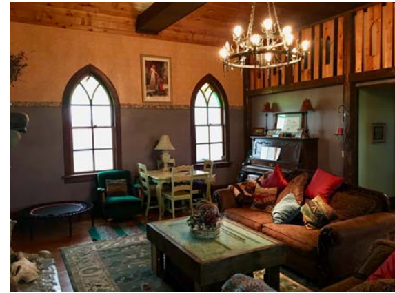
Belly Acres Lodge

The Tour ends after breakfast on Saturday morning.