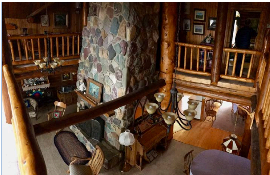
The Lodge at Glenwood

travel backroads through Beazer and Mountain View to Hillspring where we will visit the "Antique Barn" and view a long arm quilting demonstration. Supper will be a wiener roast and corn bust at "The Meadows". Remember to bring your lawn chairs.