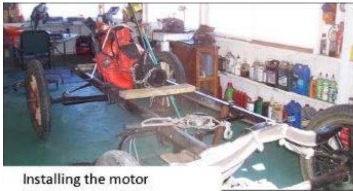
Installing the motor

I have always been interested in Model T's. I started acquiring Model T parts in the 1970's and looked forward to restoring my treasures. Work, family and many other interests delayed this until I joined the Calgary Foothills Model T Ford club in 2012. I had a problem and that was, we were enjoying the warm winters of Baja Mexico