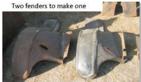
Two fenders to make one

Next, I had to acquire all the parts and necessary tools to build a 1926 Roadster pickup. The machine work and crankshaft and flywheel balancing were done in Canada. New parts were purchased from Lang's. Over a period of five