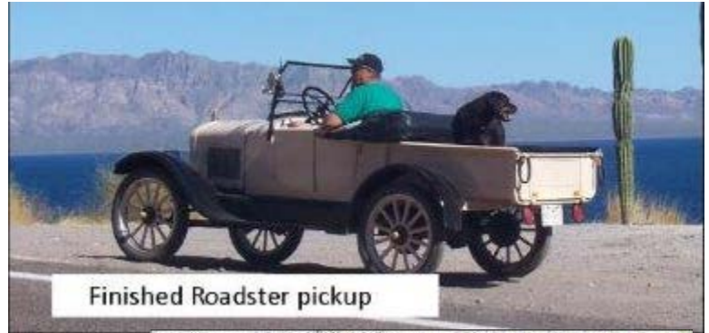
Finished Roadster pickup

years, I had the pleasure of building a 1926 Roadster Pick-up and a 1926 Touring, 3 nice running T motors and transmissions, 2 Ruckstell rear-ends and 2 stock rear-ends.