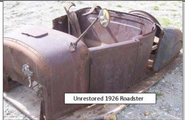
Unrestored 1926 Roadster

and also enjoying many activities in Canadian summers. The only solution I could come up with was to build Model T's in the Baja. We purchased a house in the Baja December 2013 and I built on an attached 12 ft. by 32 ft. shop. The view from the 1 meter by 2-meter windows was palm trees and the sea of Cortez.