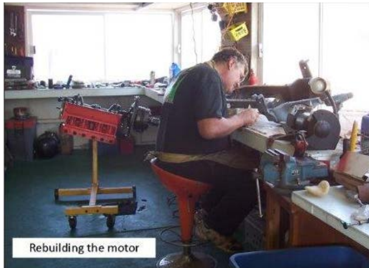
Rebuilding the motor

years, I had the pleasure of building a 1926 Roadster Pick-up and a 1926 Touring, 3 nice running T motors and transmissions, 2 Ruckstell rear-ends and 2 stock rear-ends.