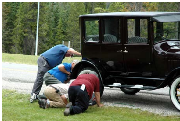
All the king's horses 2004

It seems like there is always one more part I need before I can complete a job, so I have a lot of unfinished business. Recently I have been freshing a couple of engines that lost magnets, and working on my closed cab pickup project. Lateley I have been learning a lot about hydraulic brakes. I visited Bert Curtis recently where I picked up some 1940 Ford brake parts. Following the big fire in March he is actively working on a number of interesting projects including a mid engine powered super car.