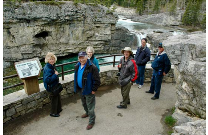
Fall Colours Tour 2004