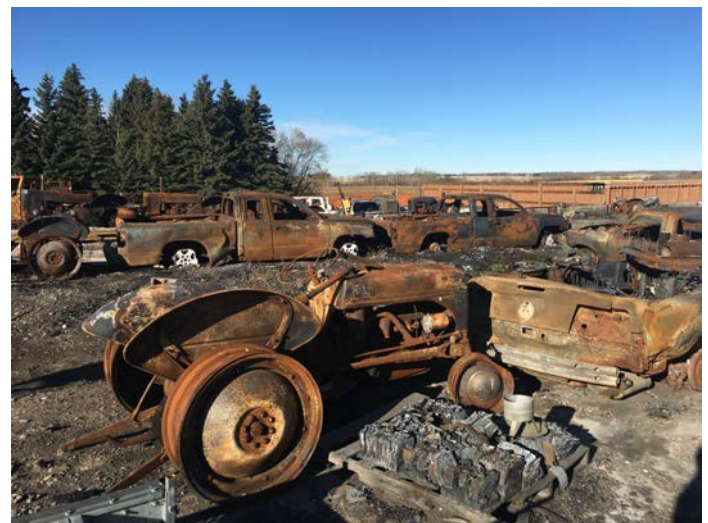
Bert Curtis' Collection