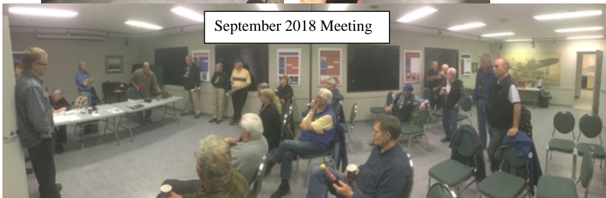
September 2018 Meeting