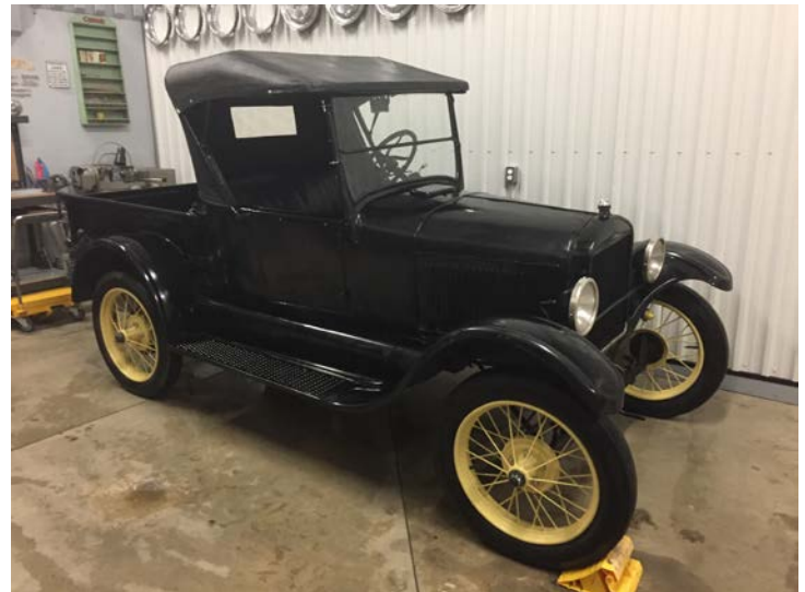
Art Burgess's T shined up for the tour... too bad it was cancelled

The Foothills Model T Club was well represented and Stub enjoyed seeing the old cars and getting together with old friends.