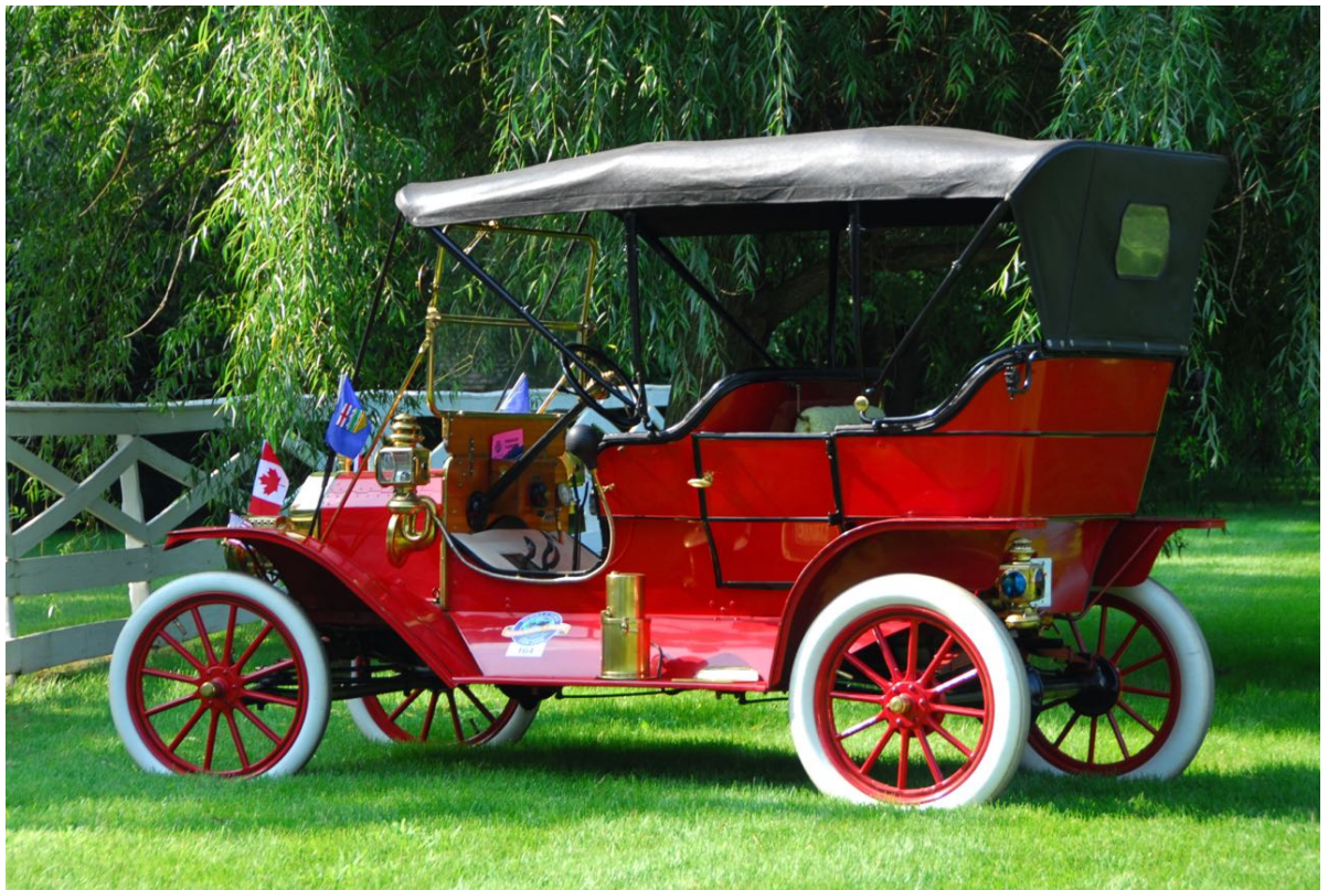
Cliff Proctor's 1909

During the early days of the Model T, tires were very expensive in relation to the rest of the car. Latex rubber was harvested in South America and shipped to the United States. It took armies of workers and vast forests to produce the needed raw material. Tire manufacturers would add sulfur and other vulcanizing agents to make the rubber pliable over a wide temperature range. Fillers like chalk, talc and zinc oxide added elasticity and durability and made the expensive latex go further, reducing the cost of each tire. Zinc oxide was the filler of preference because it produced bright white tires.