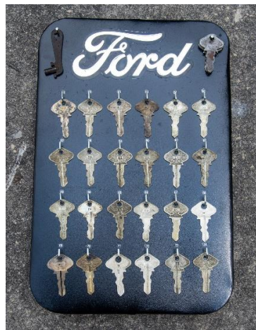
Came from Chaffin's