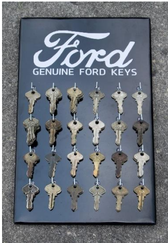
< Made two with uncle