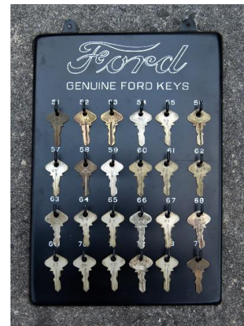
Repo of Dealer board