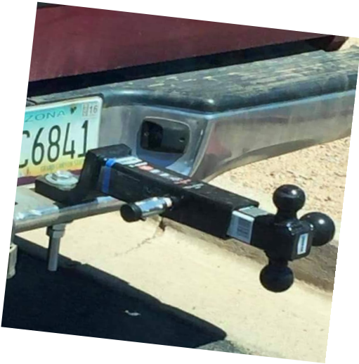
A screw driver???