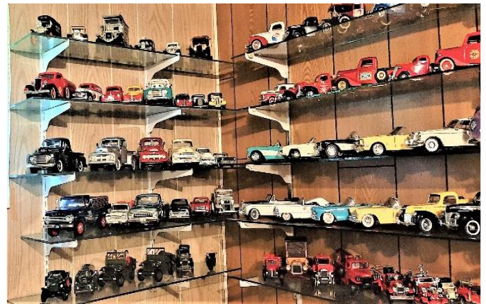
A portion of the more than 325+ car and truck models