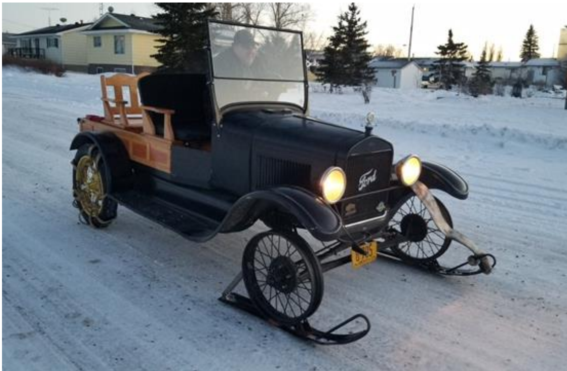
The white strap, on the far side, was for towing (if needed)