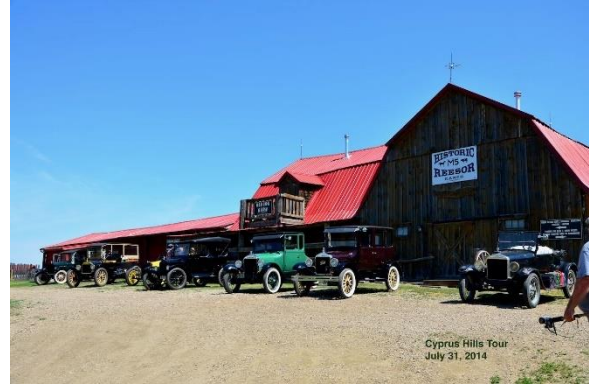
Cyprus Hills Tour July 31, 2014