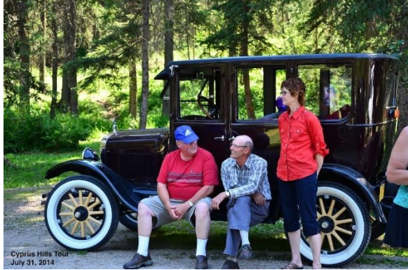
Cyprus Hills Tour July 31, 2014