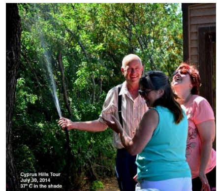
37c in the shade!!!