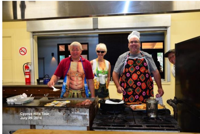
Cyprus Hills Tour July 29, 2014