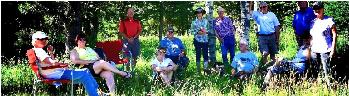
Cyprus Hill 2014 – What we have to look forward to!!

MEETING NOTICE: Wednesday April 27 - WILL be held at the The Hanger Flight Museum 4629 McCall Way, NE Calgary