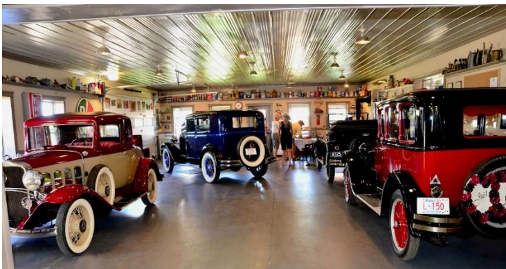
Dusty Wheels Garage, Fred & Teri Holt Collection