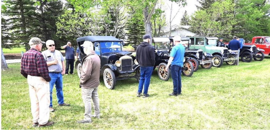
The usual Model T chats