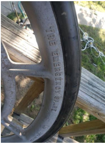
"The Emergency Spare"