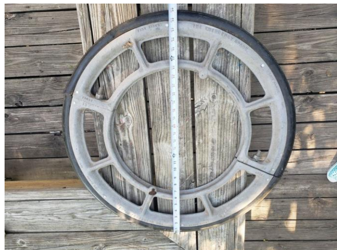
A spare to get you home