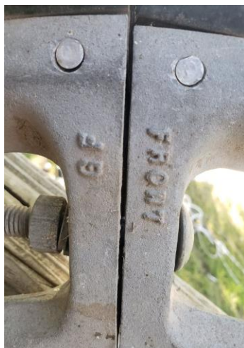
2-piece, bolts together