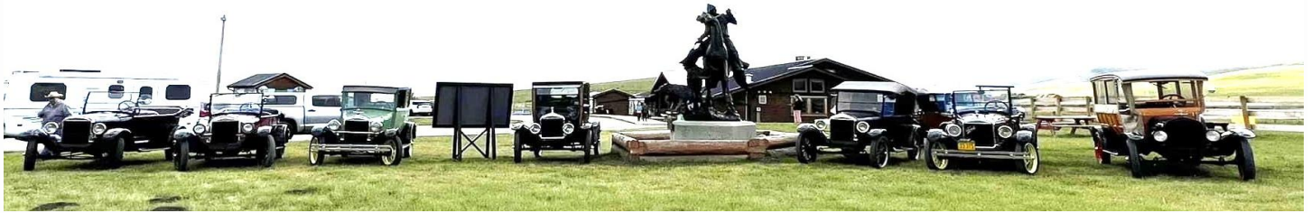
We gathered around the statue of George Lane

And, of course, what T tour would be complete without an ICE CREAM STOP!!