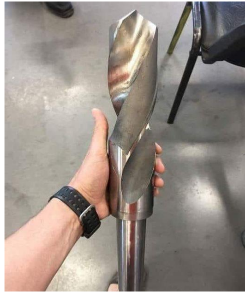
Never forget the correct placement of the decimal point when ordering a 7.5mm drill bit.