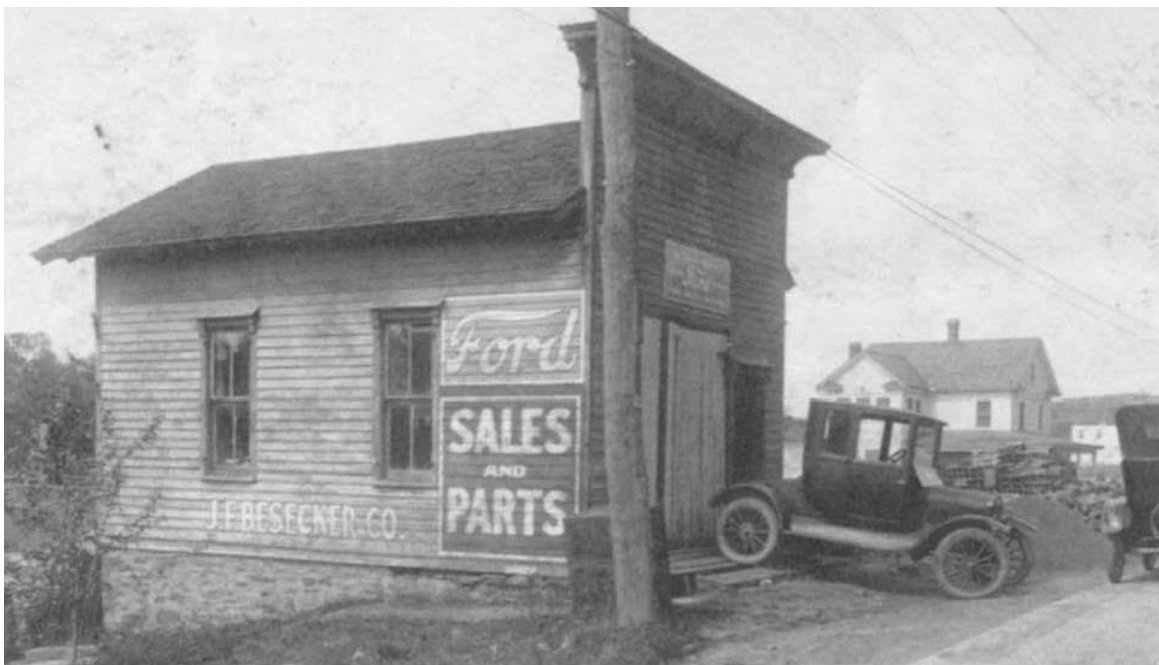
A typical Model T dealership

To make a gift to support the MTFCA or Model T Museum, click here. www.MTFCA.com