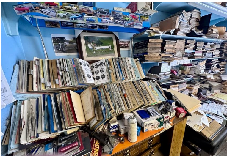
In the days before computers