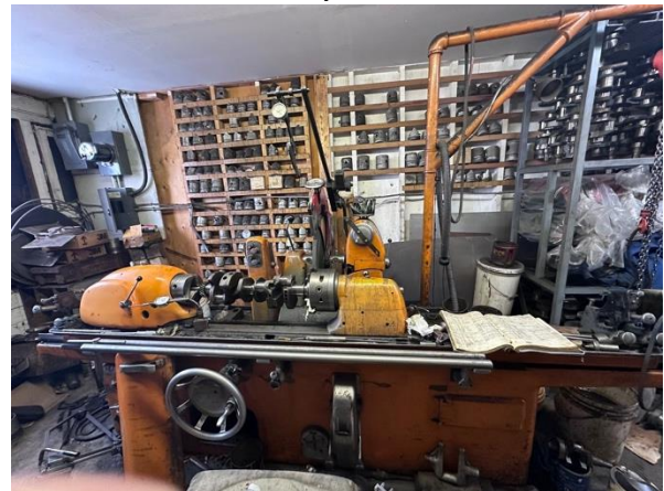
Crankshaft Lathe - Some Model T cranks just don't have enough good metal left to regrind and sometimes the good ones are too bent to salvage.