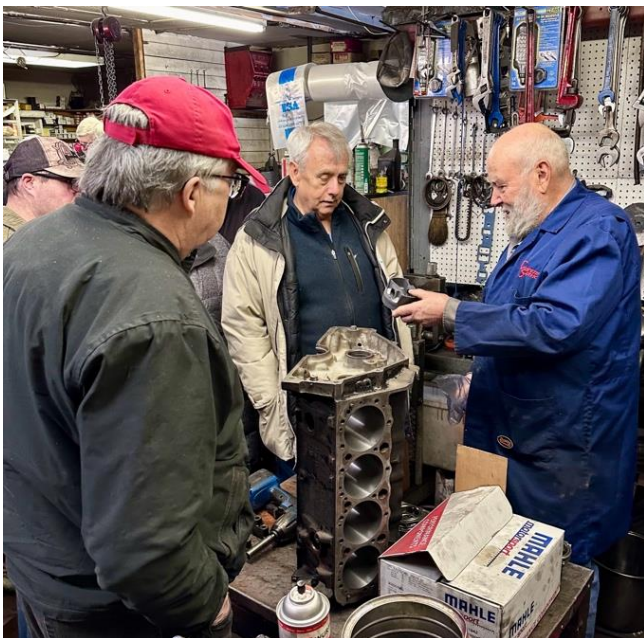
Super lightweight pistons for a Chev 350 drag truck engine.

Bert purchased this building in 1967 for $3,500.