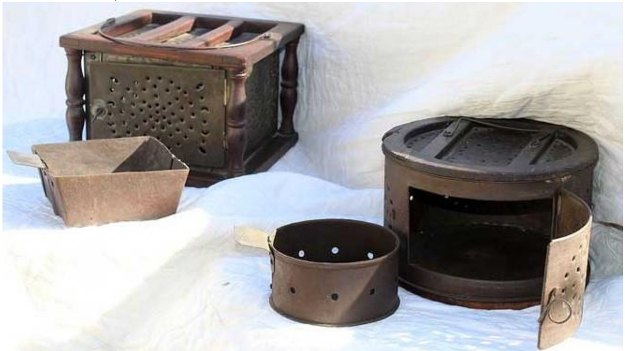
A large foot warmer alongside a rare round foot warmer with their respective metal boxes to contain the coals.

Wikipedia: A foot stove consists of a wooden box which is open on one side, with holes or a slab at the top. In it, a bowl made of pottery or metal with burning charcoal was placed. The feet were positioned on top of the stove to become warm.