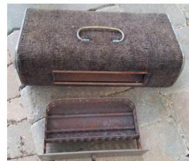
A Side tray model