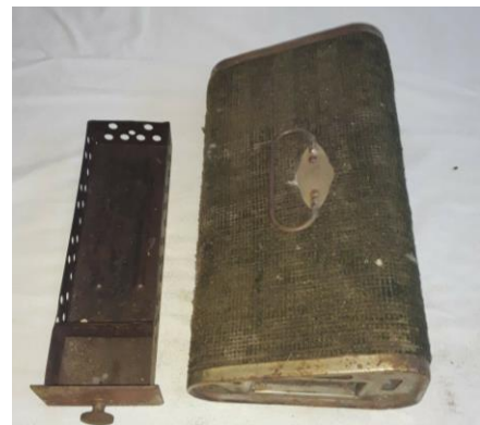
A Clark 7C from somewhere in Babb, Montana