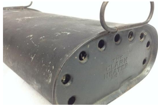
A bare Clark #5