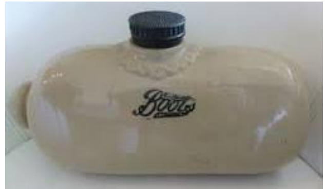
A Boots porcelain warmer