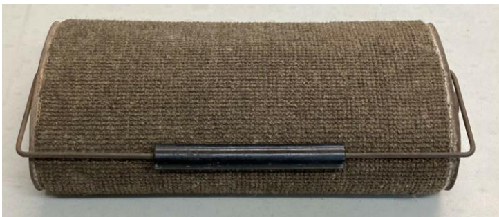
On e Bay - 3 ebunnyz