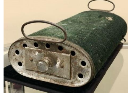
A well used Clark #3 For sale at 'Gold & Silver of Baton Rouge, Louisiana