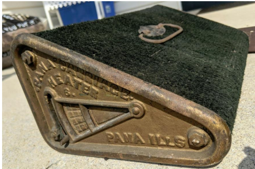
On e Bay - 'CRSLES-Half'