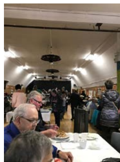
A few of the 600+