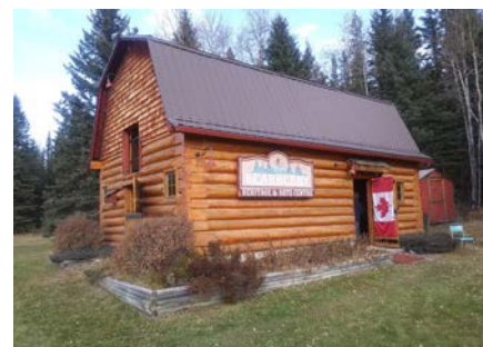
Heritage & Art Center