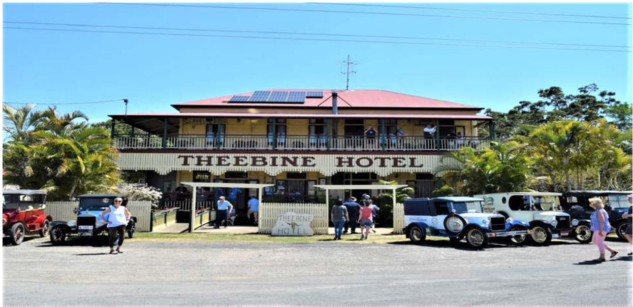
Theebine Hotel where we had lunch, typical Australian (& British) Bangers & Mash.