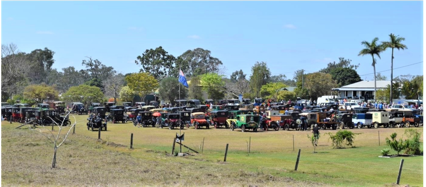
Cars lined up in a park in Tiaro.

Monday was a drive in the country, with a tea break in Tiaro and lunch at the Theebine Hotel.