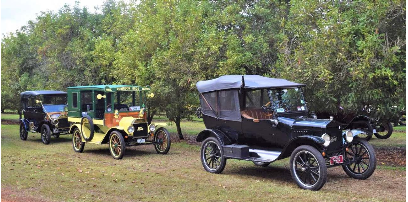
Cars lined up between the rows of trees on the farm.

Wednesday , we went to Hervey (pronounced Harvey) Bay via Burrum Heads. That evening we had dinner & a movie. We were able to see the movie Mister Banks, which is about Walt Disney & how he managed to persuade Pamela Travers, the author of Mary Poppins, to make her story into a movie.